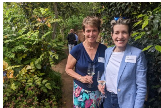
Guests stroll the gardens during the Sip & See Wine Tasting