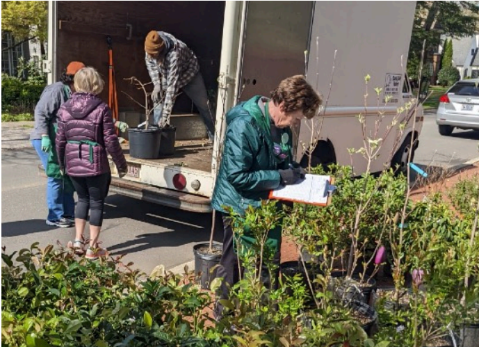
Nursery volunteers work hard to make each and every Plant Sale a success—from ordering plants to receiving deliveries as well as working shifts during each sale!

I've been fortunate enough to see the fruits of these communities—volunteers offering one another rides, bringing meals when a member of their team is sick, gathering socially outside of