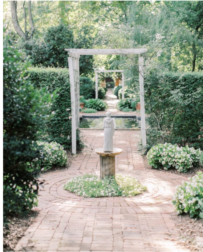
Kagawa Path, Wing Haven Garden & Bird Sanctuary