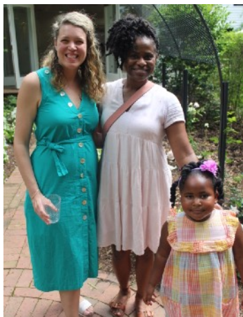
Tea Time in the Garden