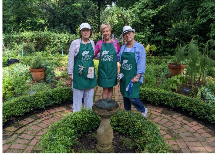
The Herb Garden volunteers brave the heat to care for the plantings in the historic Herb Garden and the garden beds in front of the Clarkson's House.

A special thank you to our volunteer chairs and the members of their respective teams! Our volunteers really know how to grow communities.