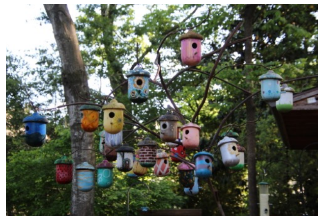
Bird houses in the SEED Wildlife & Children's Garden